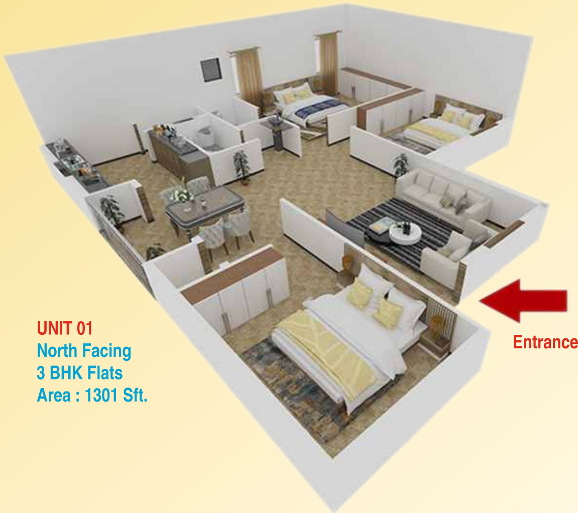
UNIT 01 North Facing 3 BHK Flats Area : 1301 Sft.